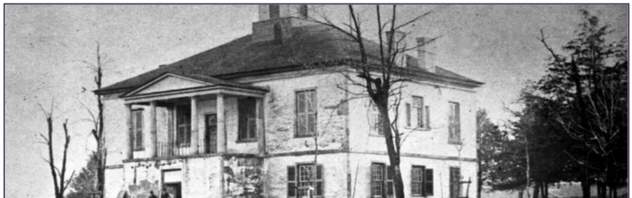
Original Courthouse built in 1791