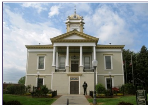
Restored Old Burke County Courthouse Today

Beginning in 1885, many changes were made to the building, including the exterior being covered with stucco, the porticos were raised, and the original cupola was replaced with an ornate cupola of the Baroque style, which remains today.