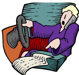
Do not phone and drive

“THE PENALTY FOR USING THE MOBILE TELEPHONE WHILE DRIVING IS A FINE OF $100.00. THE BILL DOES NOT ALLOW FOR DRIVER LICENSE POINTS OR INSURANCE SURCHARGES FOR VIOLATIONS.”